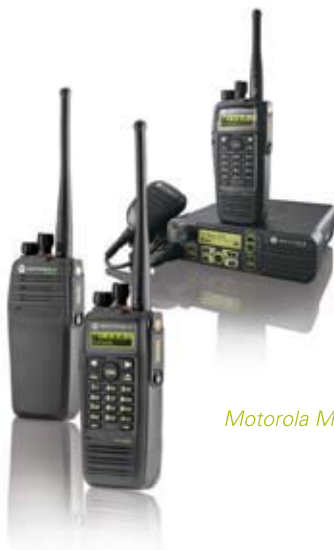
Motorola MOTOTRBO XPR Digital Radios

“When the administrative assistant responded, the audio quality was crystal clear,” he says. “She sounded like she was standing right next to me even though I was underground and she was 12 miles away. To be standing below ground, next to a boiler, and still have that kind of coverage and quality means that the MOTOTRBO radio system works. It’s as simple as that.”